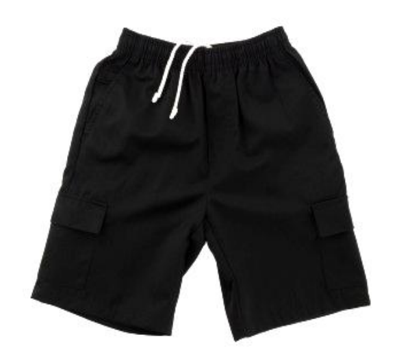
Boys Cargo Shorts $20.00

Poly Face - Cotton Back (180g - 60% Cotton / 40% Polyester) Micro mesh polyester face and cotton back. Contrast panels and shoulders match a tipped edge placket, knitted collar and bands, while double stitched shoulders and armholes ensure a solid performance all season long.