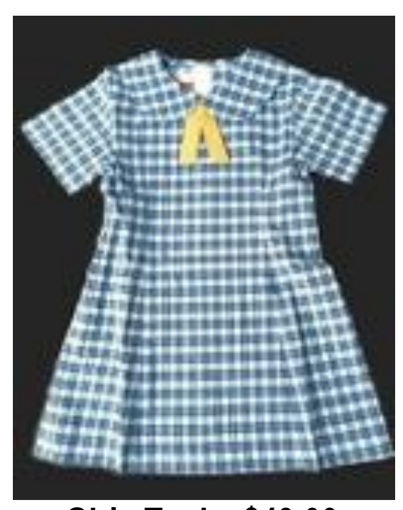
Girls Tunic $49.00 Cotton Tunic with zippered pocket. Available in sizes 4 – 16.