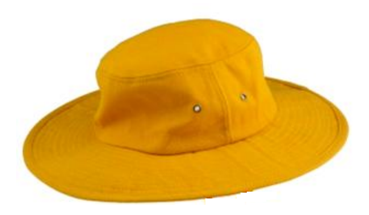
Brim Hat $10.00

Twill Weave 100% Brushed Cotton, 270g With its 50+ UPF rating, the surf hat is reliable lightweight protection against sun and glare. The completely soft structure allows it to be rolled, folded or collapsed into convenient pocket size. It features a covered sweat band and metal air flow eyelets for comfort, while its stitched brim adds form and durability.