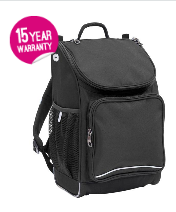
Backpack - Harlequin Mighty Tuff-Pack $55.00

✓Built-in anatomical back panel ✓15 year warranty