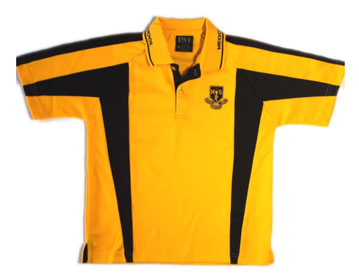
Short Sleeve Polo Children Sizes $30.00

Poly Face - Cotton Back (180g - 60% Cotton / 40% Polyester) Micro mesh polyester face and cotton back. Contrast panels and shoulders match a tipped edge placket, knitted collar and bands, while double stitched shoulders and armholes ensure a solid performance all season long.