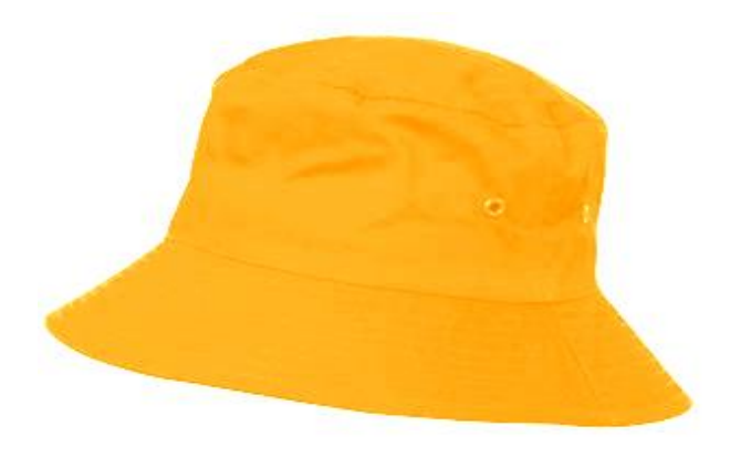
Surf Hat $10.00

Twill Weave 100% Brushed Cotton, 270g With its 50+ UPF rating, the surf hat is reliable lightweight protection against sun and glare. The completely soft structure allows it to be rolled, folded or collapsed into convenient pocket size. It features a covered sweat band and metal air flow eyelets for comfort, while its stitched brim adds form and durability.