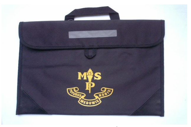
Library Bag $13.00

This versatile and high quality library bag is ideal for protecting books. A popular seller and a must for all students, it features water resistant nylon and reinforced seams for quality that can't be beaten. Iron on transfer logos can be added to these bags.