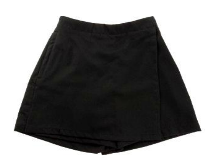
Girls Skort $20.00

Polyester/Cotton, 270g Elastic waist with draw cord and two side pockets. All seams safety stitched. Double stitched hem