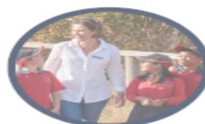
Build skills through fun